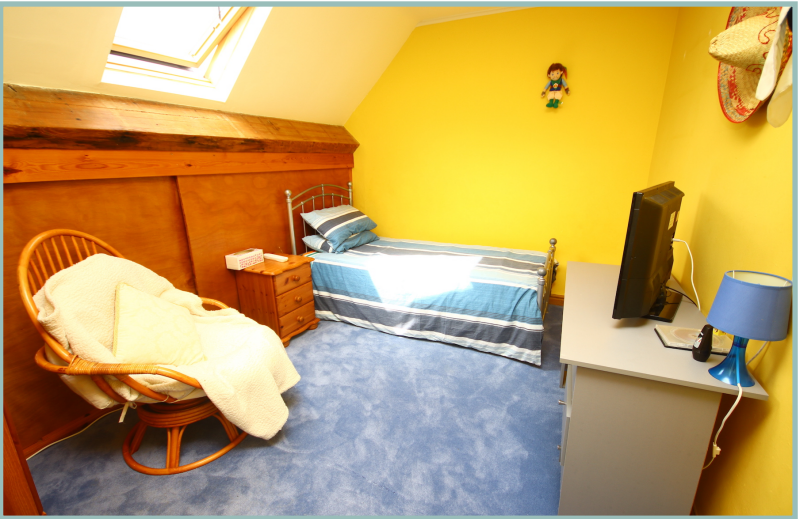
Bedroom Six 13' 6" x 8' 10" 4.11m x 2.69m