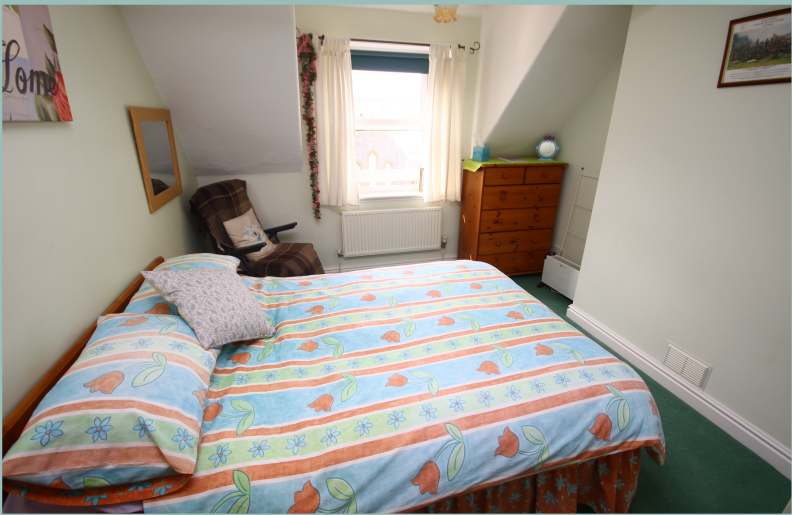
Shower Room 6' 6" x 5' 1.98m x 1.52m