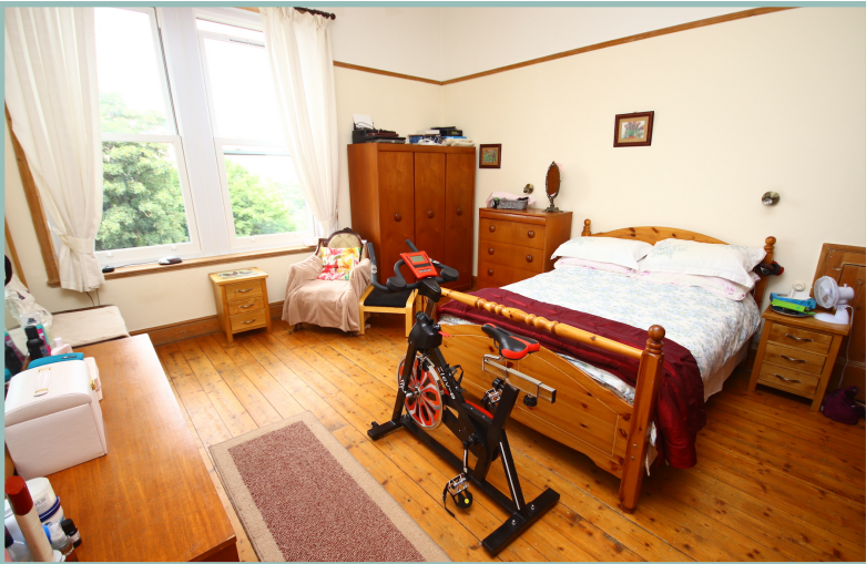
Bedroom Two 13' 7" x 13' 3" 4.14m x 4.04m