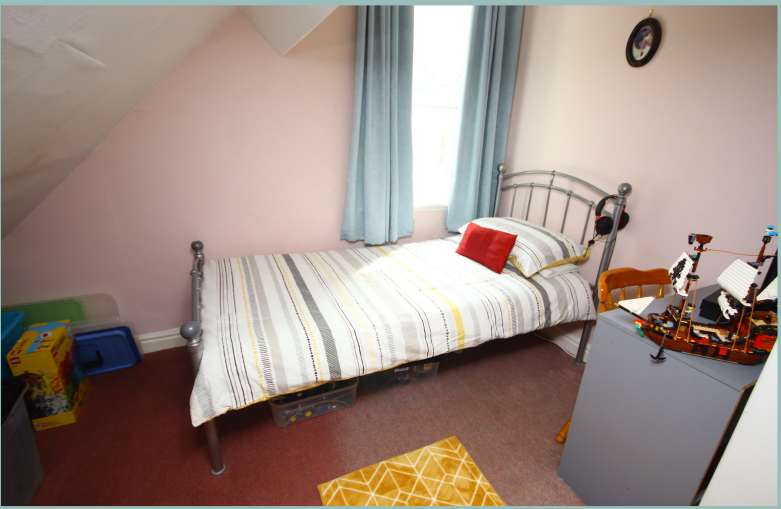
Bedroom Five 11' 1" max x 10' 4" 3.38m x 3.15m